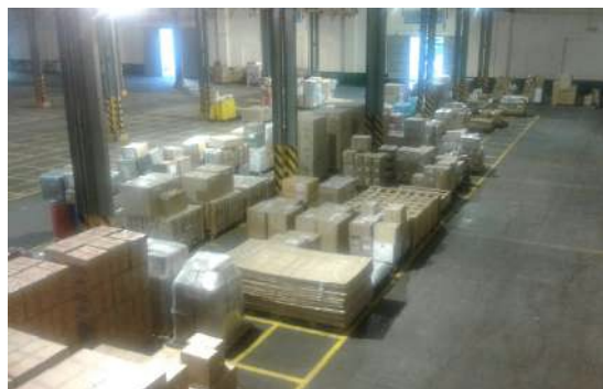
OFFICE AND WAREHOUSE

Strategic port-based receiving offices and warehouses