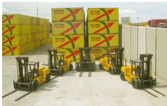
CARGO HANDLING EQUIPMENT

Company owned prime movers, wing-vans and closed vans