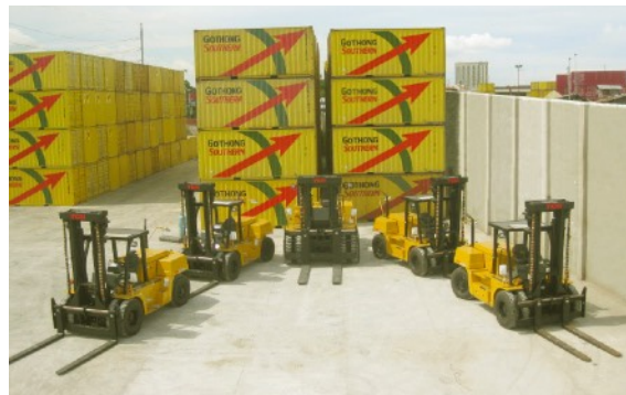
CARGO HANDLING EQUIPMENT

Company owned prime movers, wing-vans and closed vans