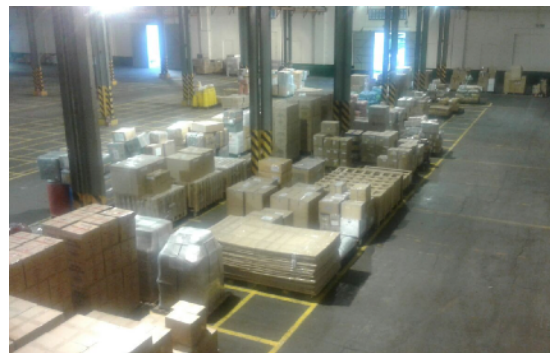
OFFICE AND WAREHOUSE

Strategic port-based receiving offices and warehouses